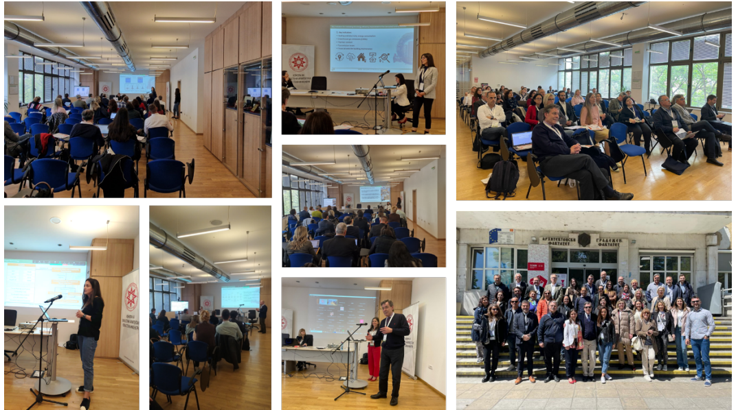
Highlights from the first Workshop: papers presentations, Working Group Meetings, and the Group Photo