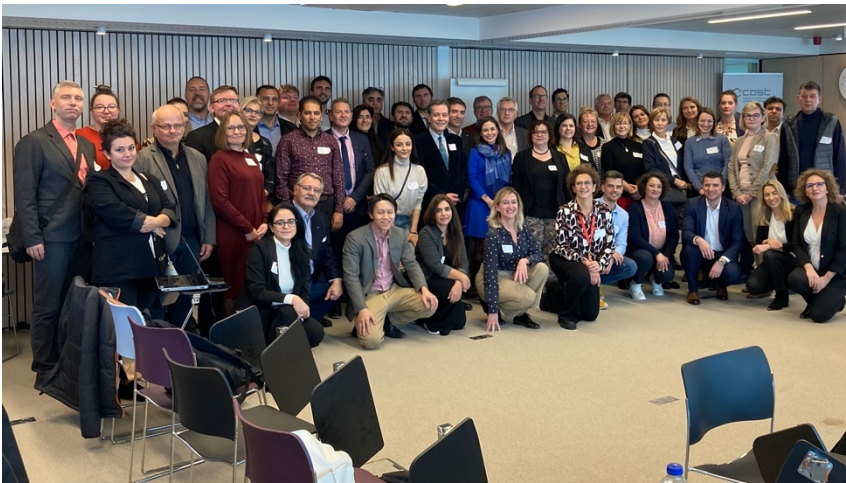
Participants in the first meeting in Brussels.